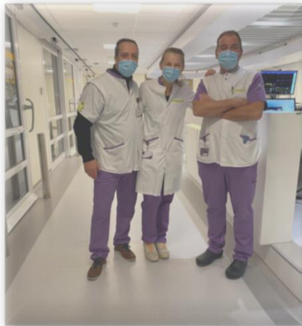
“Every employee now has a personal security guard. It is not just a service, it provides a great sense of security.” OZG